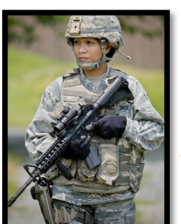
Lackland is the home of all USAF Security Forces training

Today Lackland AFB is home to more than 80 units with missions encompassing all US service branches and personnel from allied nations.